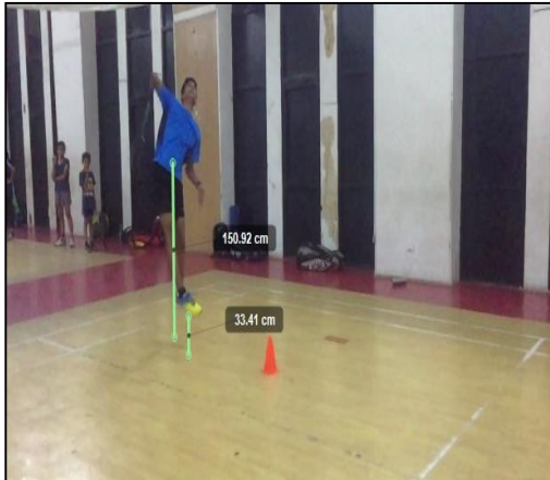
Fig. No. 2: smash was executed but base of support is narrow and body is not in the state of equilibrium, further the Jump of subject is not much, as compared to height of subject where as both the legs are closer.