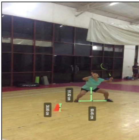
Fig. No. 3: Shows wider base of support while approaching for smash. COG is much lower compared to former subject and exactly falls within the base of support.