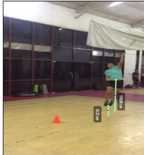
Fig. No. 4: Smash was executed but the base of support is narrow and body is not in the state of equilibrium. Body of subject is slightly turned to left which is not good for forehead jump smash as lot of energy is wasted.