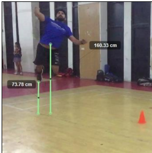
Fig. No. 6: Shows good jump for smash. CG is elevated to maximum and knees are flexed to give more air time. Upper body is wide open to clear the smash.